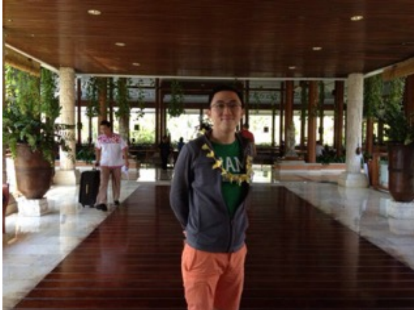
Upon arrival at Hotel Melia Bali in Nusa Dua, Bali in 2012