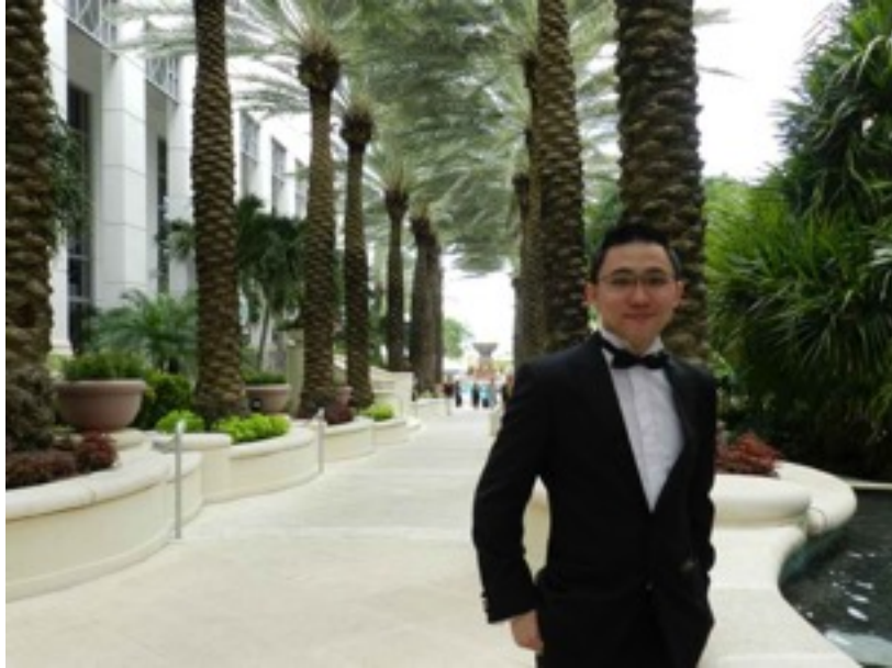
At Loews Miami Beach Hotel in Miami, Florida before our Awards Night in 2011